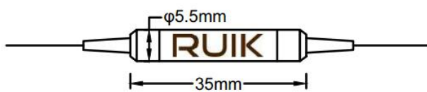
Max. Input Power:10W